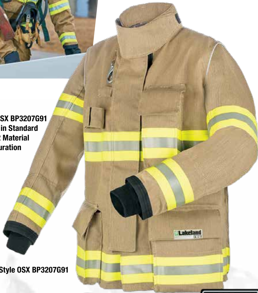
Style OSX BP3207G91 shown in Standard OSX B2 Material Configuration