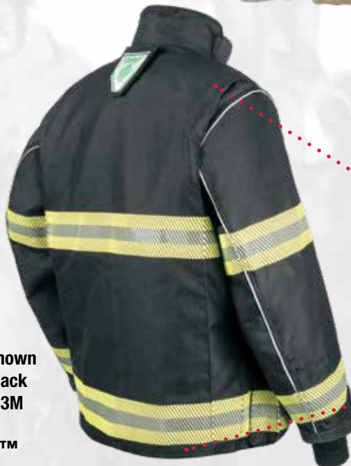
Style BP32 shown in optional Black Pioneer with 3M Segmented Comfort Trim™

Pleated shoulder and back goes from the top of the shoulder to the hem of the coat for maximum mobility