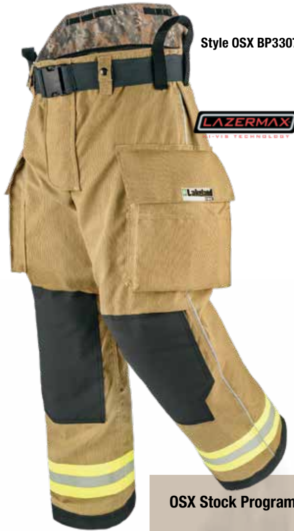
Style OSX BP3307G91